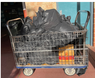
Usual amount of waste