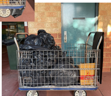
Yesterday's reduced waste